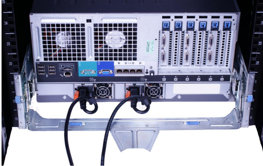
Figure 2: Routing Power Cables Through the Strain Reliefs

After you have installed the tray and cables, route the power cables through the strain reliefs located on the power supply handles as shown in Figure 2.