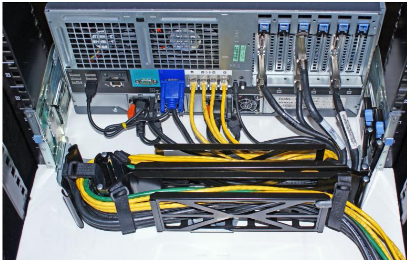
Figure 4: Right-Side Mounted CMA Installation