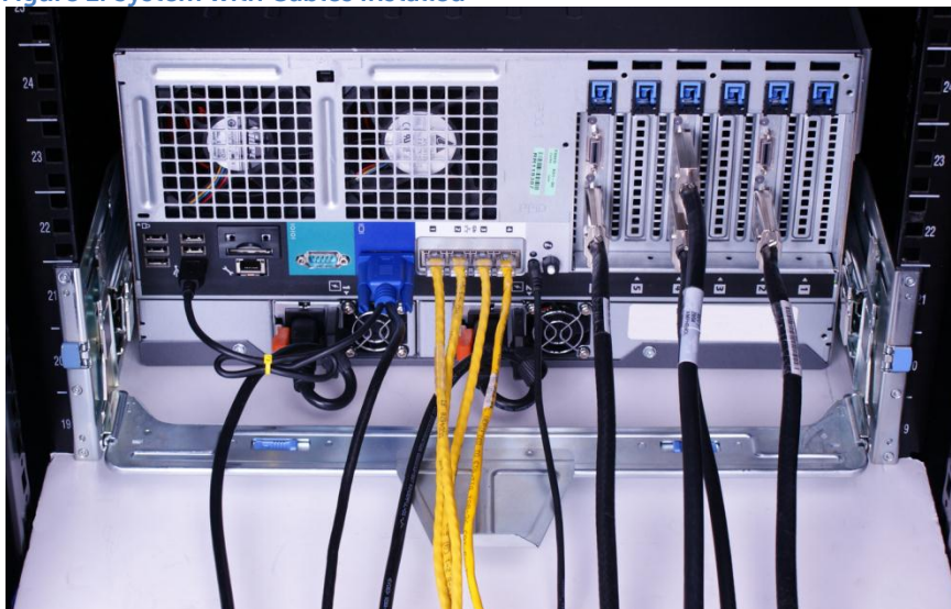
Figure 1: System with Cables Installed

Attach the CMA tray to the back of the rails as described in the CMA Installation Instructions provided in the CMA kit. Connect all applicable cables to the rear of the system and verify that all connections are secure. See Figure 1.