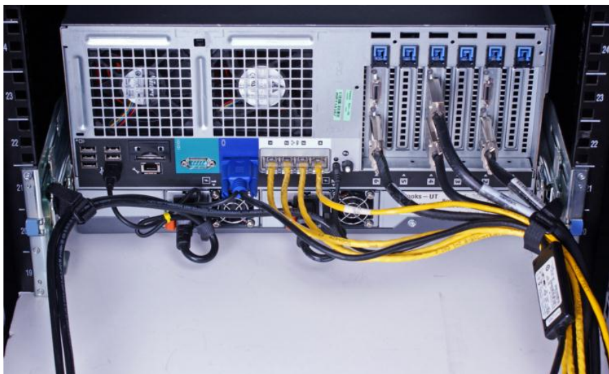
Figure 6: Cable Routing Without a CMA